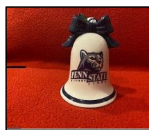
Penn State Ornament $6