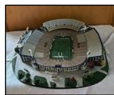
Danbury Mint Beaver Stadium $35