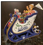
Danbury Mint Penn State Sleigh $25

Check out these items from our "HOLIDAY REGIFTING SALE"