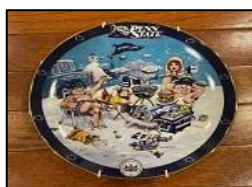
Danbury Mint The Ultimate Penn State Fan Plate Collection $10