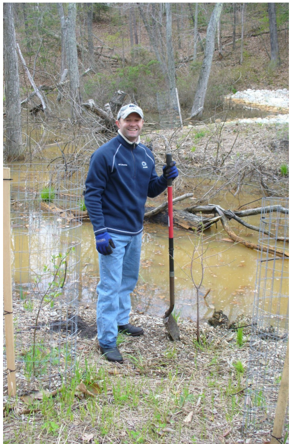
The Year in Review