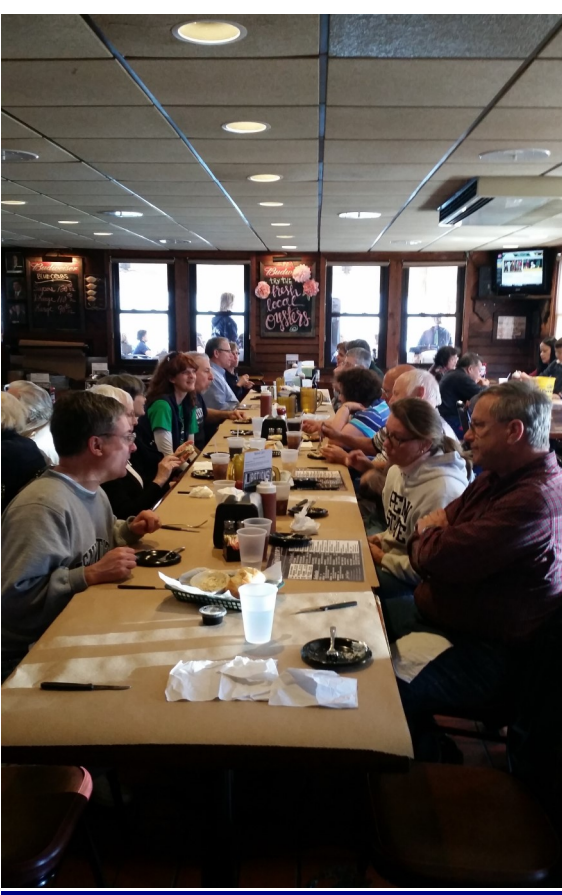
Top: Lunch after ARL Tour Below: Spring Service Project: Restoring Church Creek Headwaters area