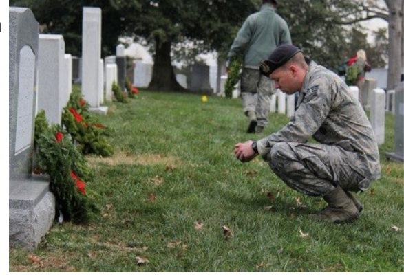
Remember and Honor the Fallen - They gave so much

Chapter members also answered the call to volunteer their time during the wreath delivery, placement ceremony and clean-up day. Our members should be proud of their service to our veterans.