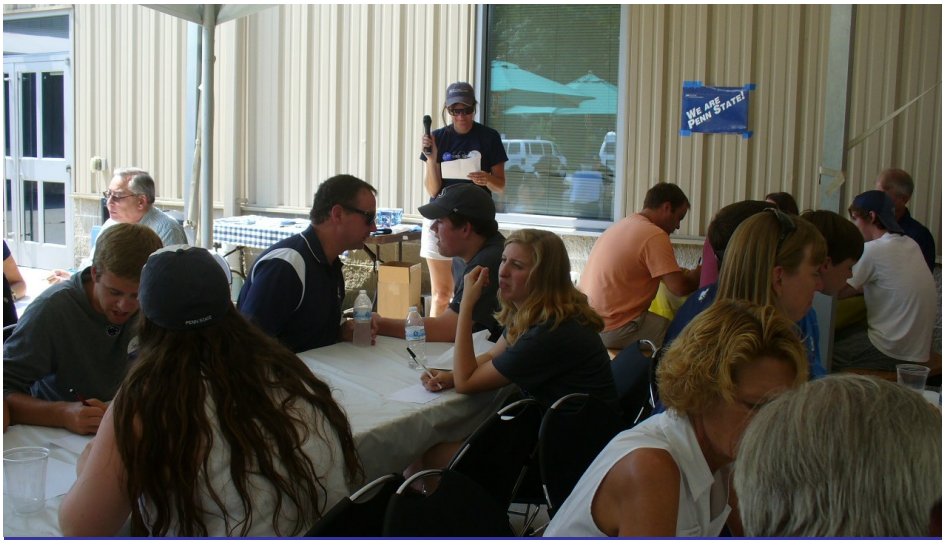
Top: The Chapter Sends Off Local Students at the Annual Picnic