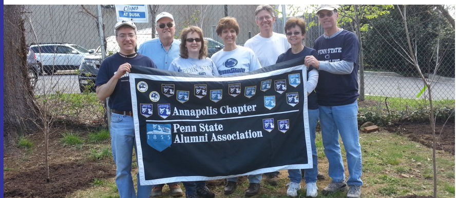
Chapter Members pose for a photo at Chambers Park.

Please contact us at PSUAnnapolis@gmail.com to volunteer.