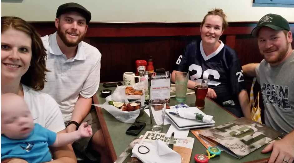
Middle and Bottom: Members Enjoy Football Viewing Parties