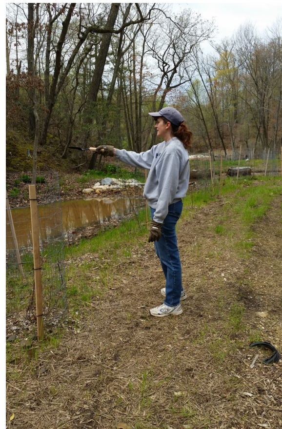
Top and Below: Chapter members work hard during the Spring Service Project