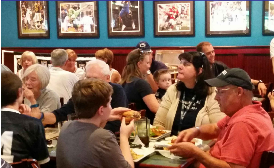
Middle and Bottom: Members Enjoy Football Viewing Parties