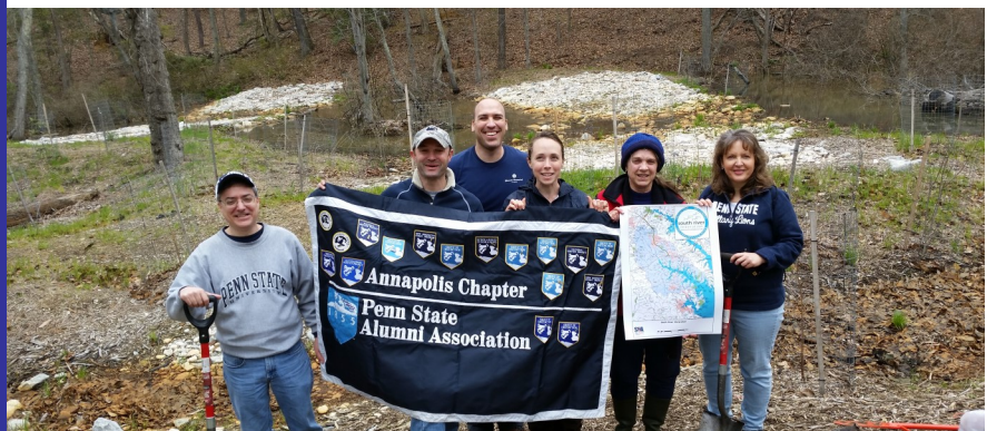
Chapter Members worked on the Church Creek Headwaters Restoration Project

Please contact us at PSUAnnapolis@gmail.com to volunteer.