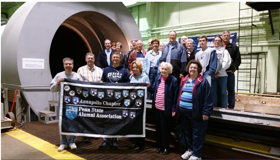
Top: Chapter Members Tour the Applied Research Lab