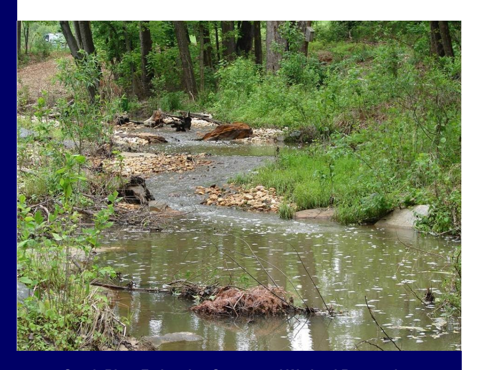
South River Federation Stream and Wetland Restoration