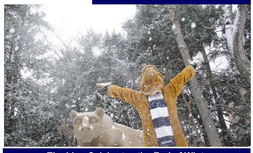
The Lion Celebrates the End of Winter