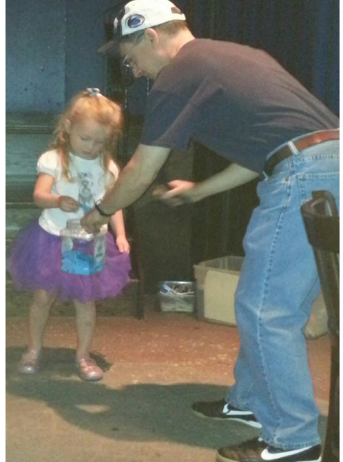
Top: The Official Cheerleading Table; Right: Raffle Ticket Drawing