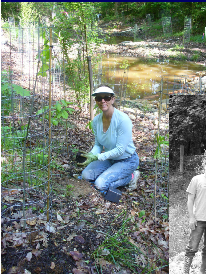
Hard working Chapter members at Spring Service Project

Our work will lead to a cleaner Chesapeake Bay.