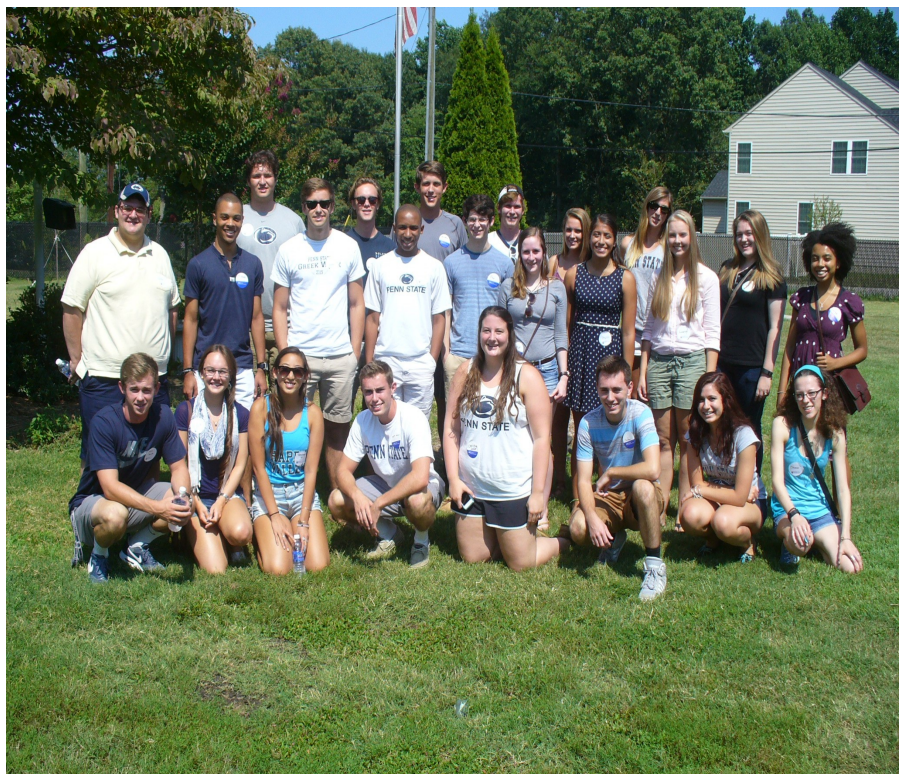
Students at Summer Picnic 2015

We are always looking for young alumni to answer students' questions about life at Penn State. If you have graduated within the past five years and would like to help, please let us know at psuannapolis@gmail.com .