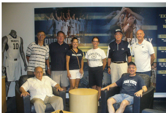
Chapter members getting a behind the scenes tour of Navy basketball